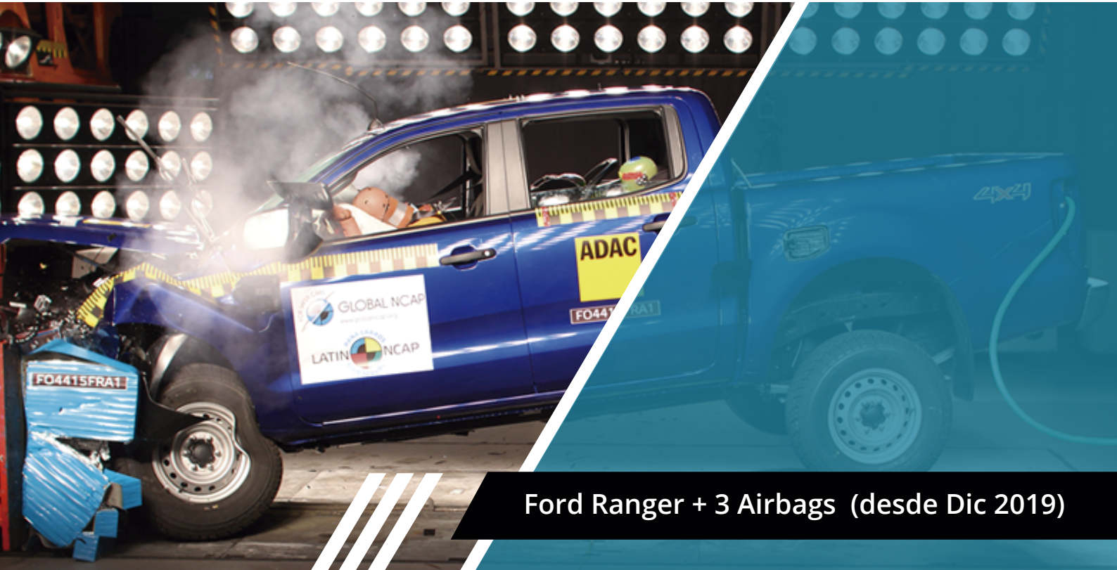
Ford Ranger + 3 Airbags (desde Dic 2019)