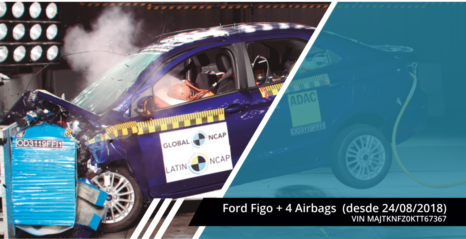
Ford Figo + 4 Airbags (desde 24/08/2018) VIN MAJTKNFZ0KTT67367