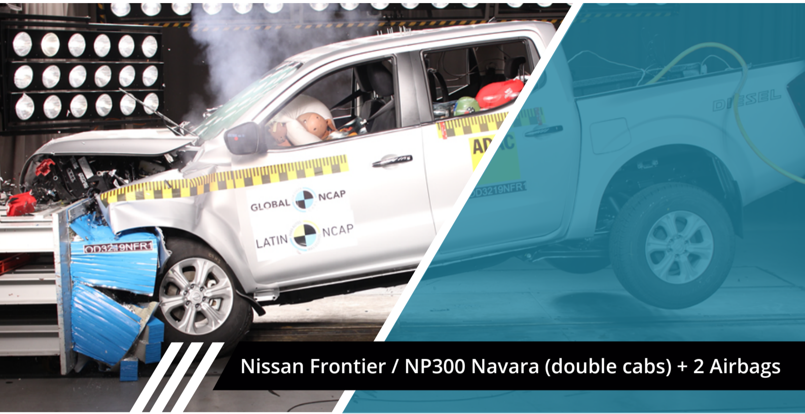
Nissan Frontier / NP300 Navara (double cabs) + 2 Airbags